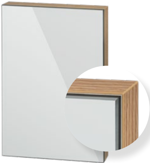
Mirror with Natural Oak edge

polytec's latest Mirror Panels products are made from 16mm particleboard substrate with 4mm glass, available in White and Black Matt options. polytec's Mirror Panels are available with a standard annealed mirror and smokey mirror.