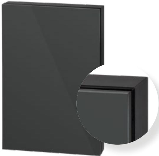
Smokey Grey Mirror with Black edge