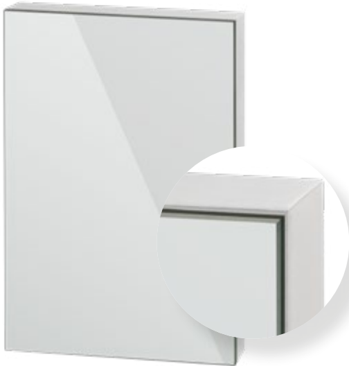
Mirror with White edge