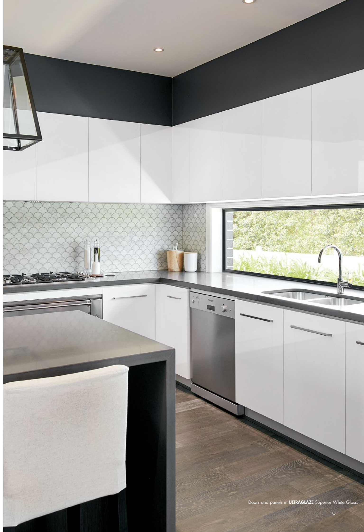
Doors and panels in ULTRAGLAZE Superior White Gloss.

For a seamless matching edge finish, available in ABS.