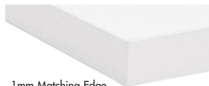
1mm Matching Edge

Designed for a sleek, modern and minimalistic look creating clean flowing lines.