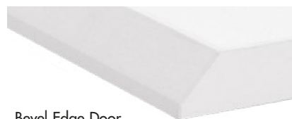
Bevel Edge Door

Designed for a sleek, modern and minimalistic look creating clean flowing lines.