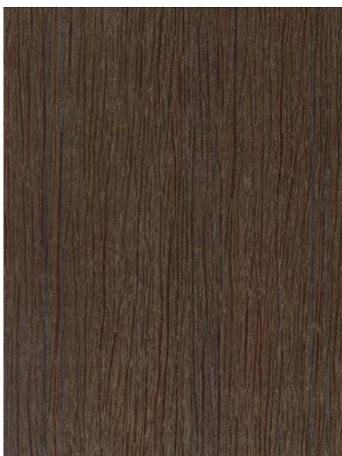
Pattern H11: Terrace Deck Range Deep brushed finish