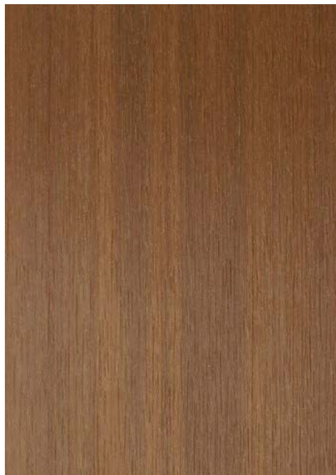
Pattern H1: Metro Deck Range (Underside) Brushed Finish