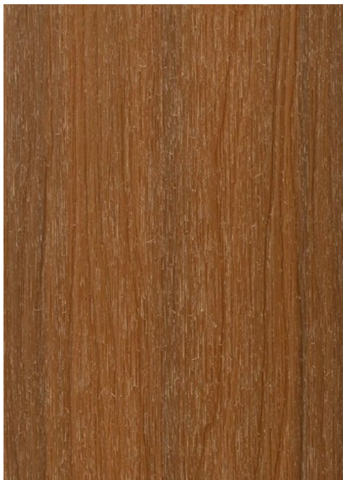
Pattern H6: Metro & Terrace Range Wood grain embossed finish